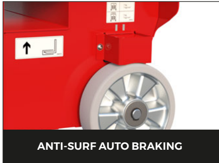
ANTI-SURF AUTO BRAKING