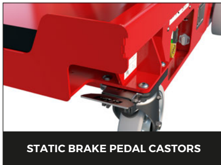
STATIC BRAKE PEDAL CASTORS