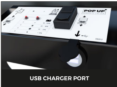
USB CHARGER PORT