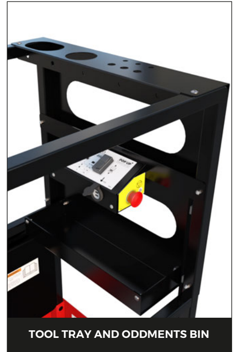
TOOL TRAY AND ODDMENTS BIN